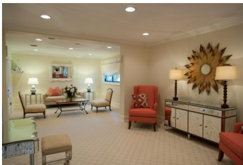
Dressing Suite at the Barn