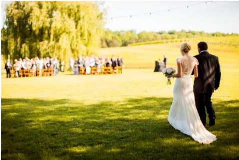
A ceremony at the willow tree