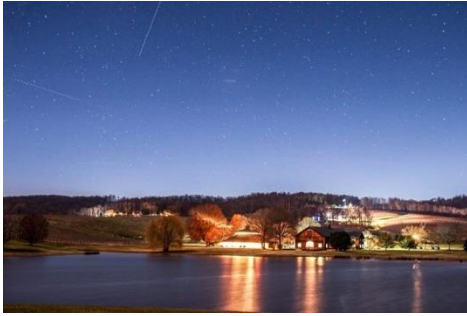
Barn & Pavilion