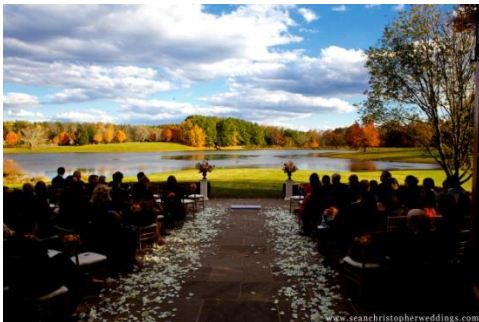
A terrace ceremony at the Barn