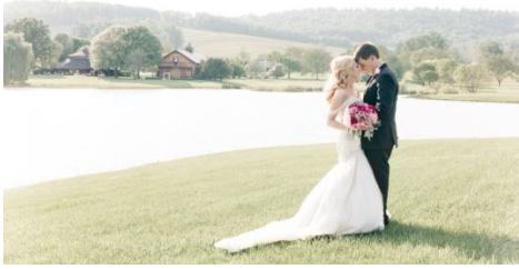
Barn & Pavilion