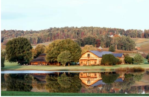
Barn & Pavilion