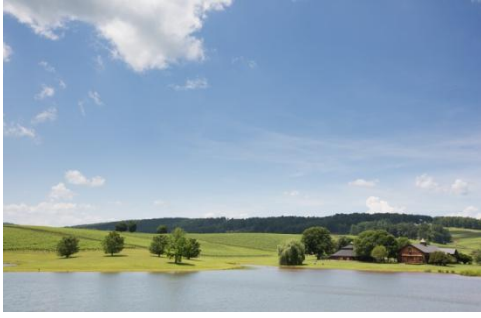
Barn & Pavilion