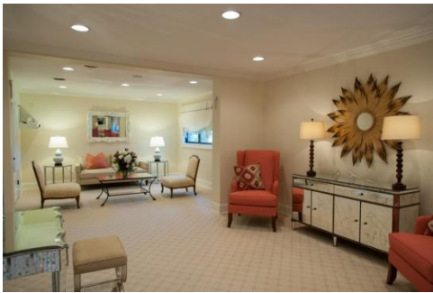
Dressing Suite at the Barn