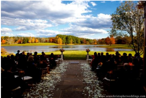
A terrace ceremony at the Barn