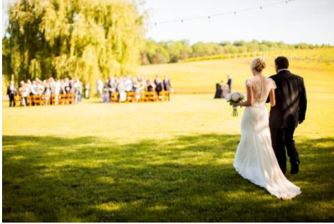
A ceremony at the willow tree