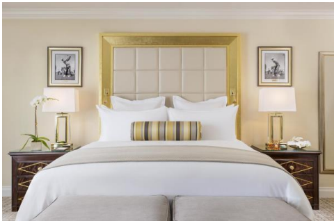
Pool House Suite