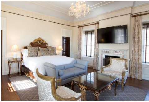
Thomas Jefferson Suite