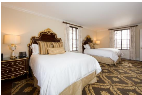
George Washington Suite